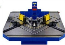
Boschert Punching Machines