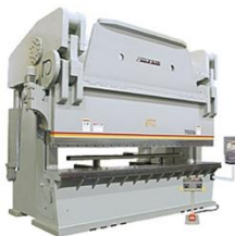
Accurpress Standard & CNC Press Brakes

HAEGER Insertion Machines Solution for virtually any of your insertion challenges