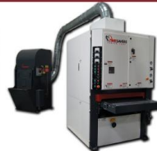
Model Lynx 37MWT Wet Filter System