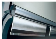
Wila/Accurpress Precision Tooling