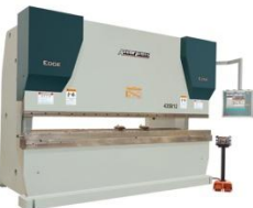
Accurpress Precision CNC Press Brakes