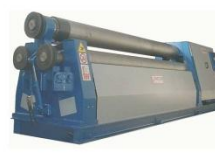
Faccin Plate Rollers