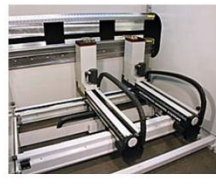
Accurpress/Automec Superiour Backgauges