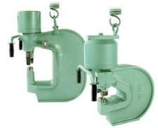
Piranha Portable Presses