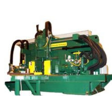
Controlled Automation drill and angle lines