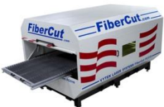
Vytek Fiber Optic Lasers