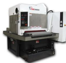
Model 2200 Slag Grinder with Wet Dust