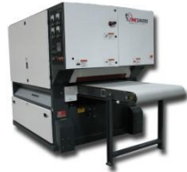
Model 3200 Dry Sander