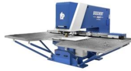
Boschert Notching Line