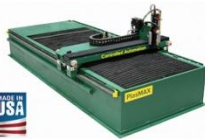
Controlled Automation Plasma