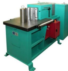
Stierli-Bieger Bending & Straghtening Machines