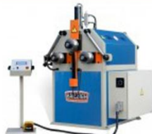
Baliegh Rollers/ Pipe Benders